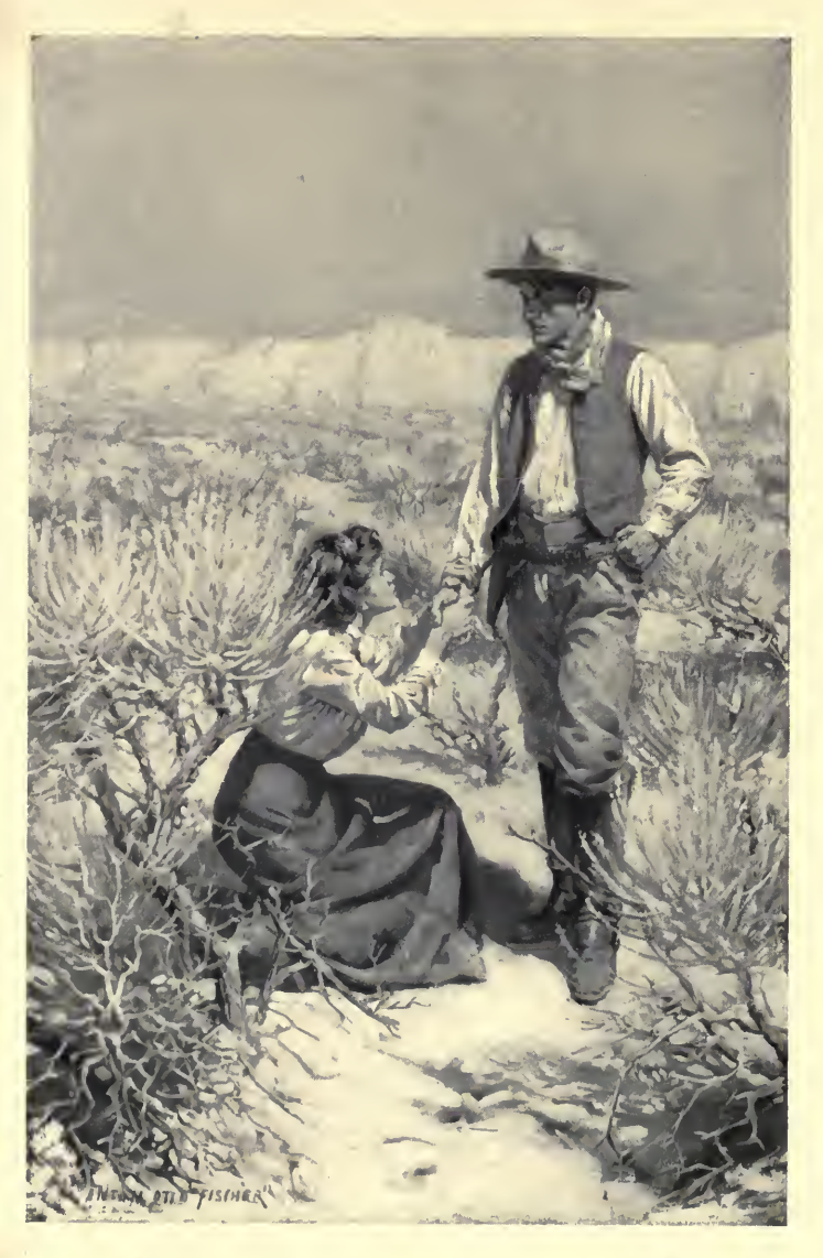
Miss Georgie gave a most unexpected sob. Page 294.